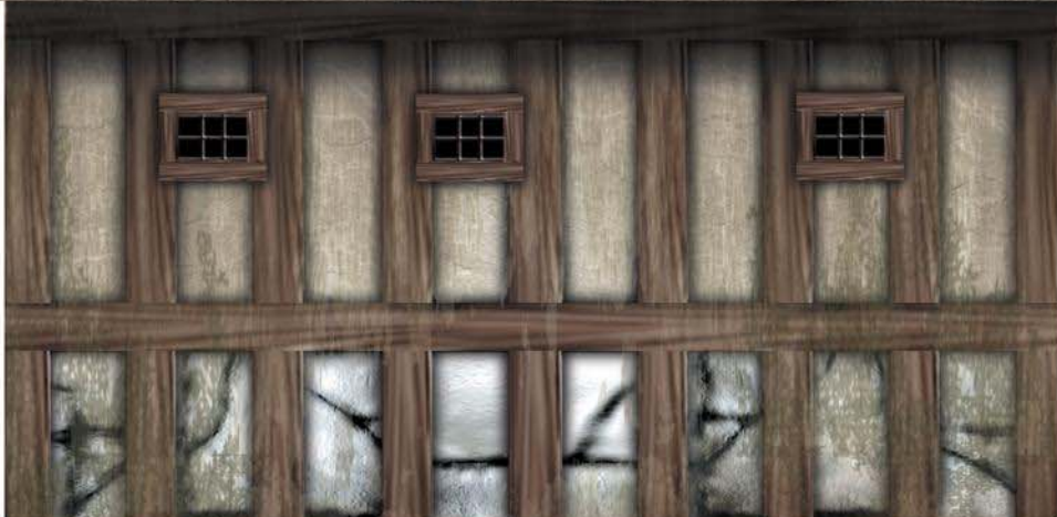
roof and wall